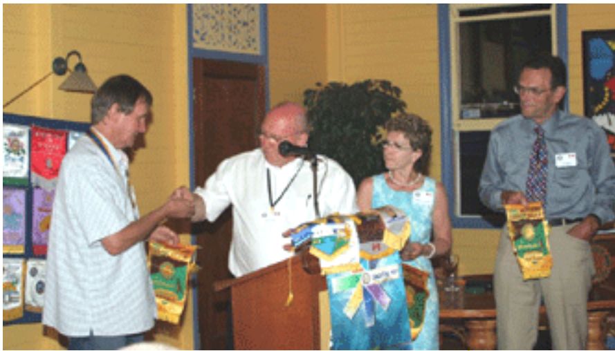
The Canadian Rotary Friendship Team visit Boonah