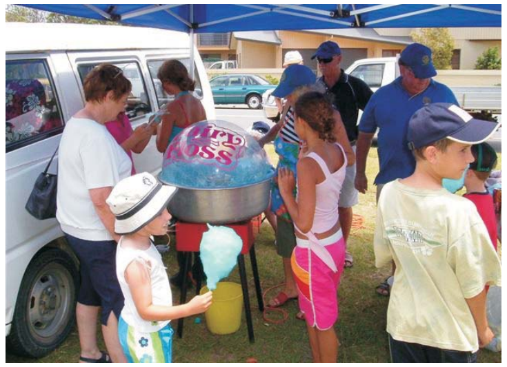
Kingscliff RC's new Fairy Floss machine helped to raise funds for the Cudgen Life Savers.