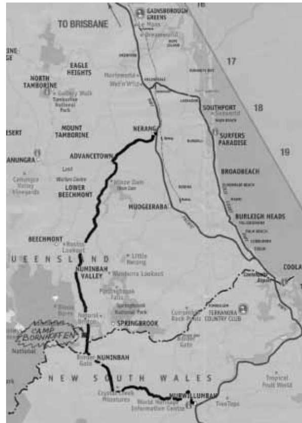
Camp Bornhoffen, Numinbah Valley, Queensland